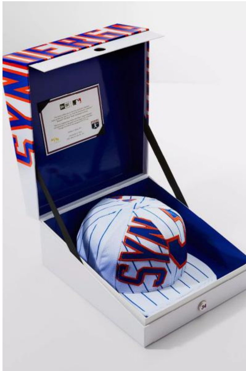
Sinst Cardboard Gift Boxes for Leather Hat Process